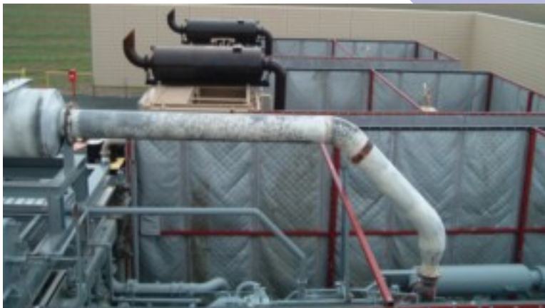
ANC-AB110-EXTR-2" Sound Curtains enclose pumps and compressors.