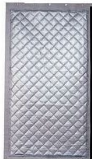
ANC-AB13X-2" Sound Curtains