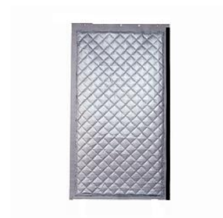
ANC-AB13X-2" Sound Curtains