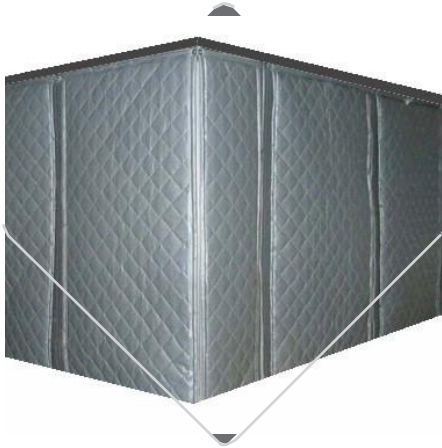
A specified and approved product used to isolate noise