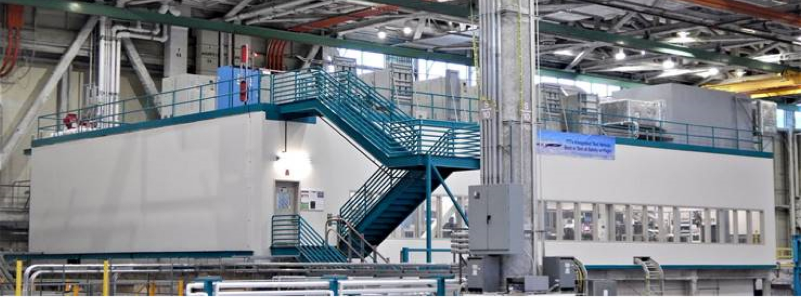
BOEING CUSTOMER PHOTOS BEFORE ACOUSTIC BLANKETS INSTALLED:

Call us to discuss your noise control issues and we'll happily work out an ideal, cost-effective solution of acoustic products to fit your application, whether it is industrial, commercial/retail, in-plant, heavy construction or virtually any application.