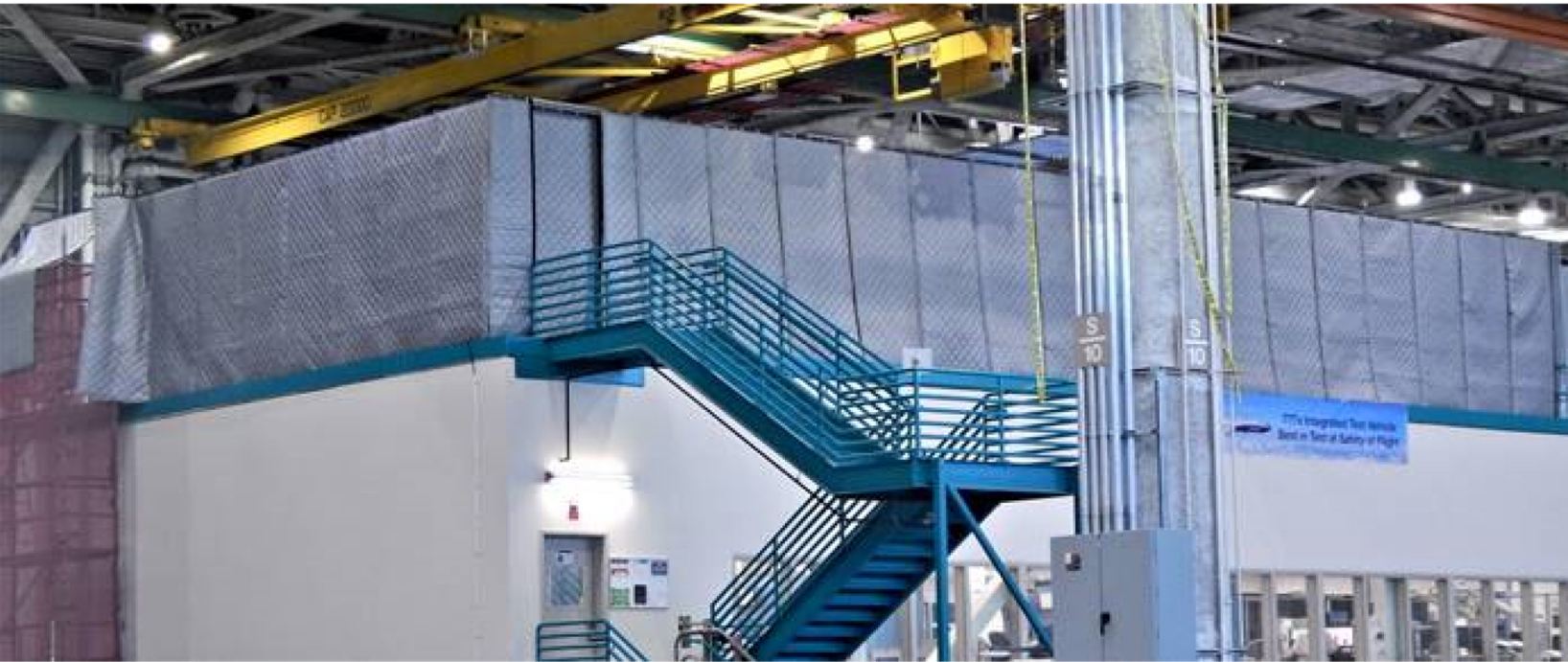
BOEING CUSTOMER PHOTOS AFTER ACOUSTIC BLANKET INSTALLED:

Call us to discuss your noise control issues and we'll happily work out an ideal, cost-effective solution of acoustic products to fit your application, whether it is industrial, commercial/retail, in-plant, heavy construction or virtually any application.