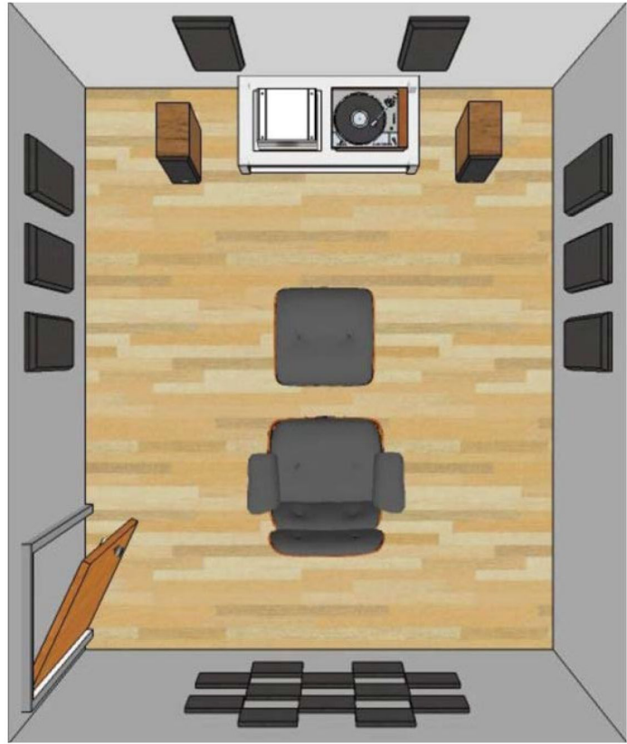
10 x 12 ft. HiFi Layout