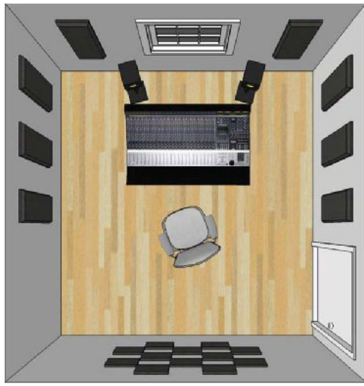
8 x 10 ft. Studio Layout