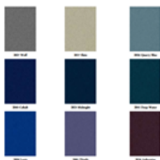
Fabric Color Chart Acoustic Fabric Chart